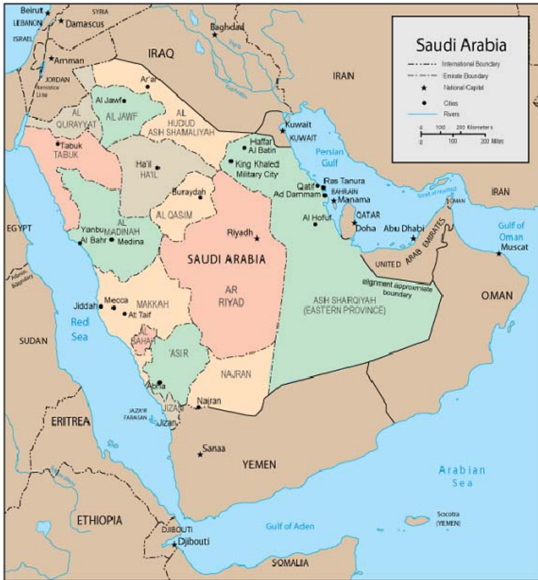
Figure 1. Map of Saudi Arabia